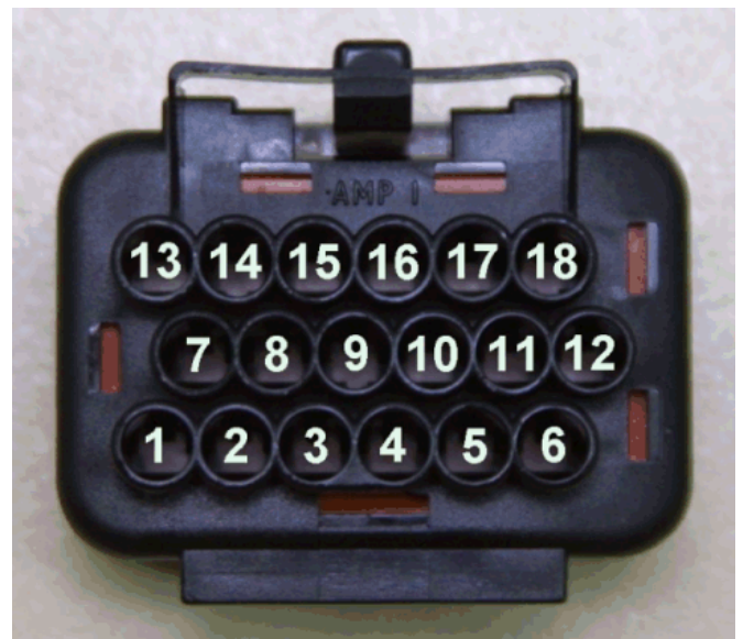
VIEWED FROM BACK OF CONNECTOR